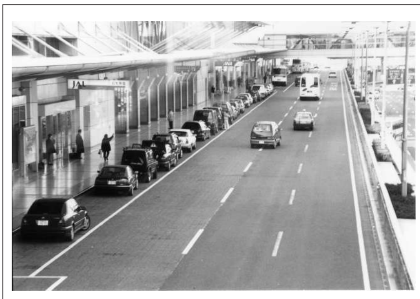
airport terminal, so

You will have eight minutes to complete this part of the test.